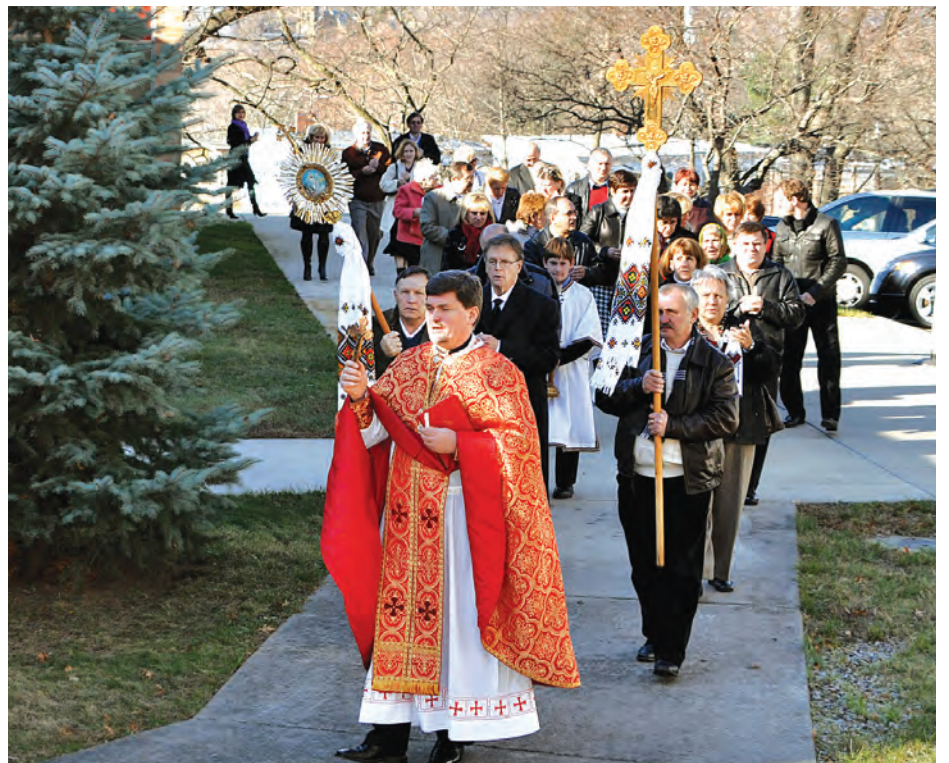
The procession at Christ the King Church.