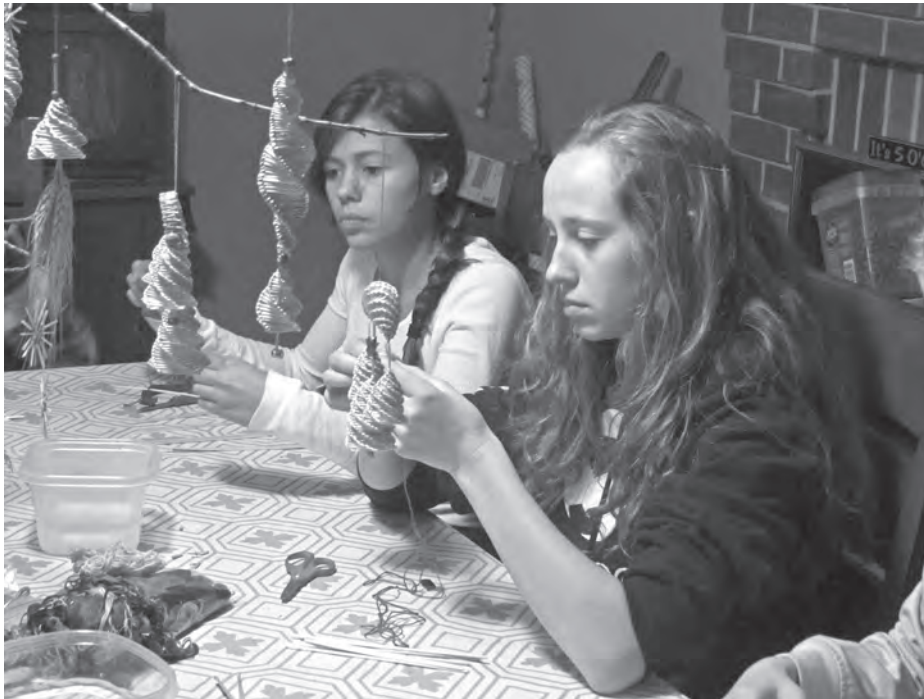
Plast members work on traditional Christmas ornaments made of straw.

She arrived early in order to prepare. With the help of some of the older girls, she clipped the straw into workable pieces and soaked it in order to make it more malleable. The younger scouts braided the straw and then formed the braid into heart-shaped ornaments. The older group wove a more intricate star-shaped ornaments, while some of the parents went on to make complicated mobiles.