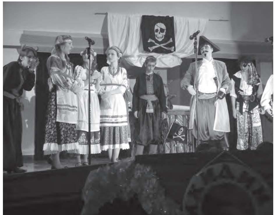
Immaculate Conception Schools Grade 8 students present the musical play "Prayer to St. Nicholas" or "How the Kozaky Rescued the Captive Maidens."

Turkish brigantine "Shykydym," where the girls are being held captive by three Turkish pirates. St. Nicholas and the messenger angel lead the Kozaks to liberate the girls.