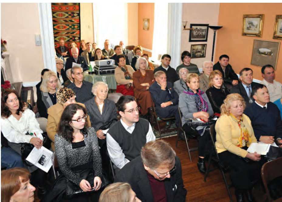
The audience at the presentation of “Okradena Zemlya,” which kicked off the Holodomor commemorations.