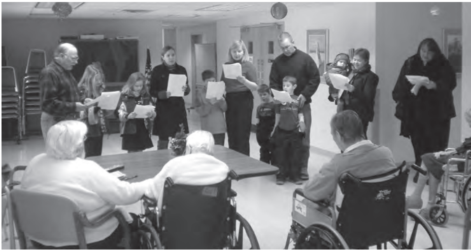
Parish youth from Hillside, N.J., carol in Ukrainian and English for retired Roman Catholic Sisters of Mercy and clergy in Watchung, N.J.

HILLSIDE, N.J. – On Sunday, December 3, 2010, St. Nicholas visited the children and parishioners of Immaculate Conception Ukrainian Catholic Church in Hillside, N.J.