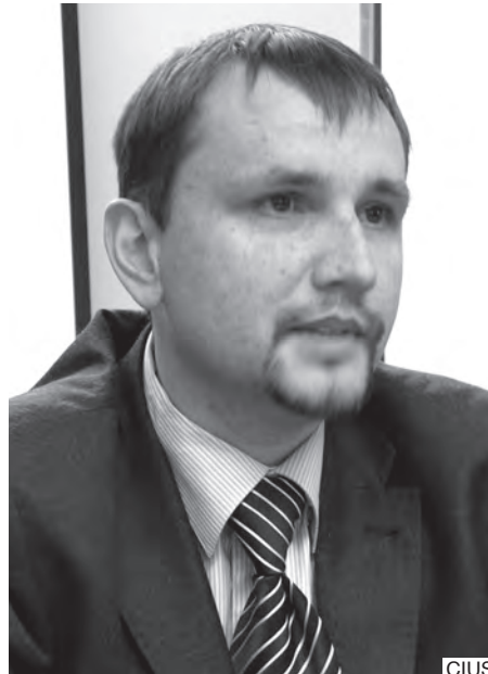
Volodymyr Viatrovych presents his lecture at a seminar of the Canadian Institute of Ukrainian Studies.

Copyright 2010, RFE/RL Inc. Reprinted with the permission of Radio Free Europe/Radio Liberty, 1201 Connecticut Ave. NW, Washington DC 20036; www.rferl.org . (See http://www.rferl.org/content/ukraine_former_officials_opposition_arrests/2260654.html .)