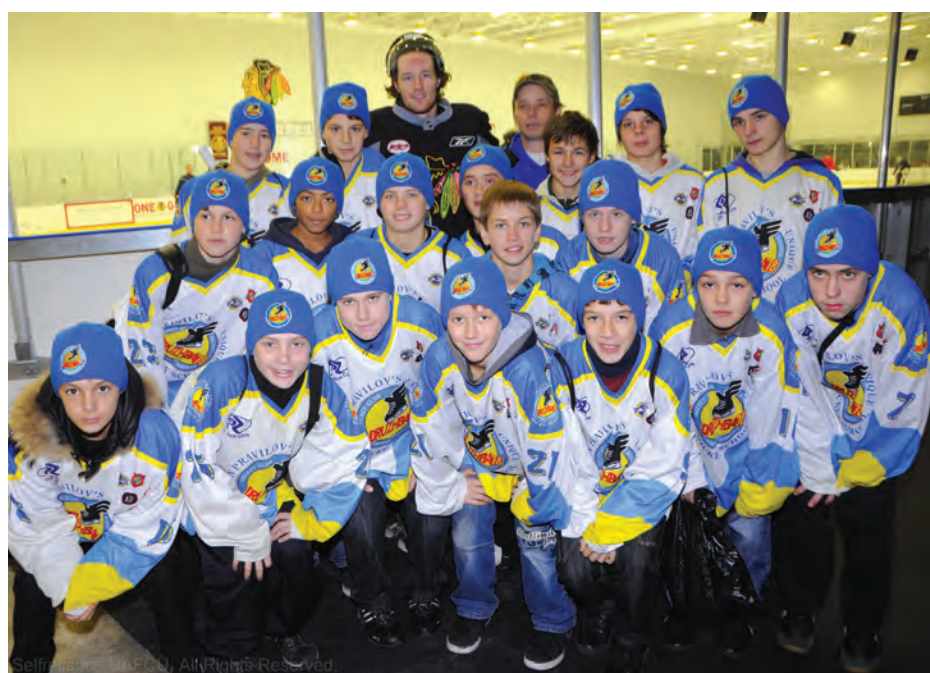
The Druzhba 78 team members meet with star defender Duncan Keith of the Chicago Blackhawks.