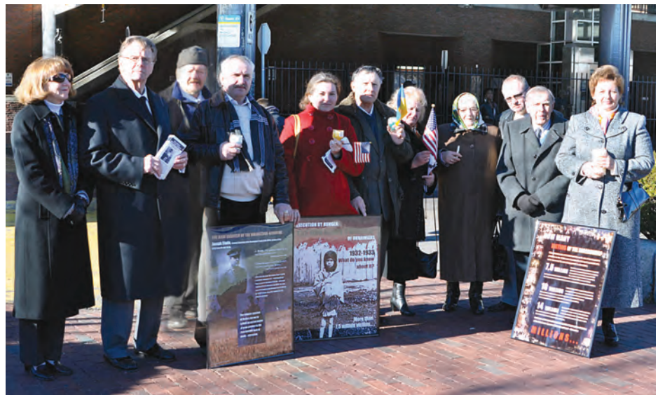
The leafleting effort at Forest Hills MBTA Station.