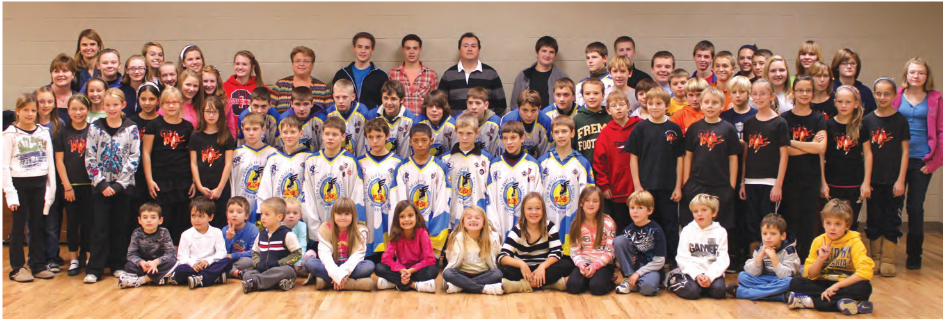
The Druzhba 78 team meets members of the Ukrainian American Youth Association of Palatine, Ill.

PALATINE, Ill. – The Ukrainian American Youth Association (UAYA) in Palatine, Ill., unexpectedly found itself the host of Druzhba 78, a youth hockey team from Kharkiv, Ukraine, in early November of last year.