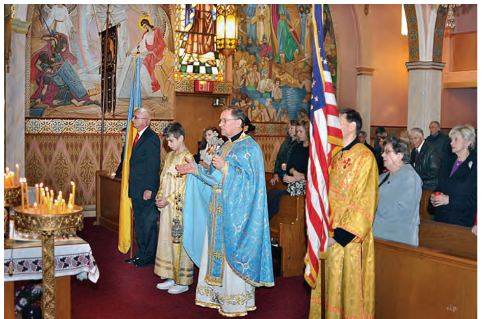
The Holodomor “panakhyda” at St Andrew’s.