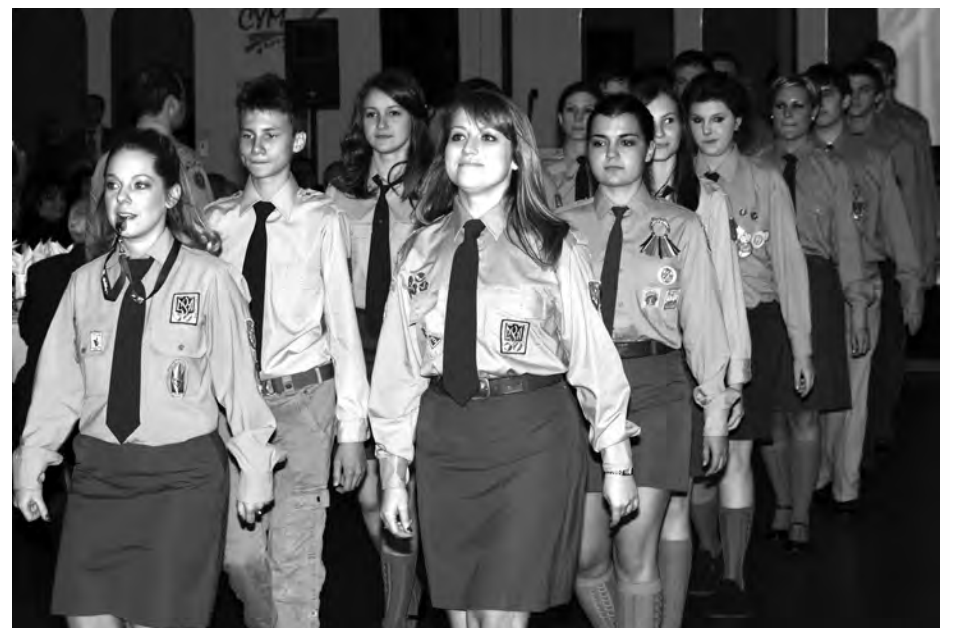
Chicago UAYA members march at the banquet.