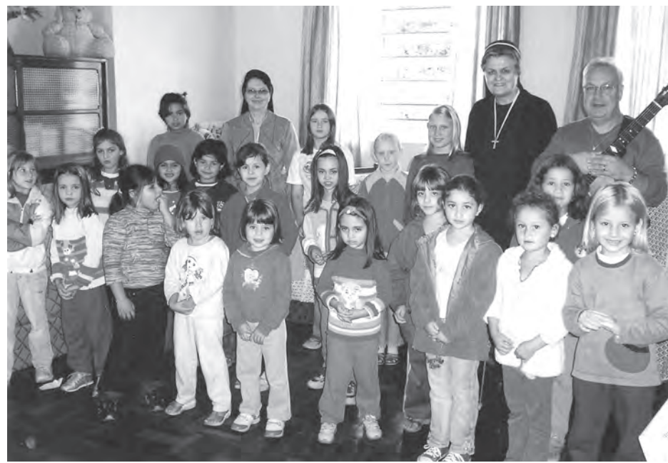
Orphans in Irata-Parana, Brazil.