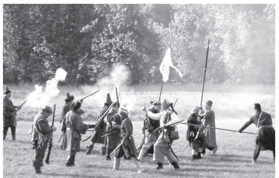
Scenes from the re-enactment of the Battle of Konotop of 1659.

To subscribe to The Ukrainian Weekly, call 973-292-9800, ext. 3042