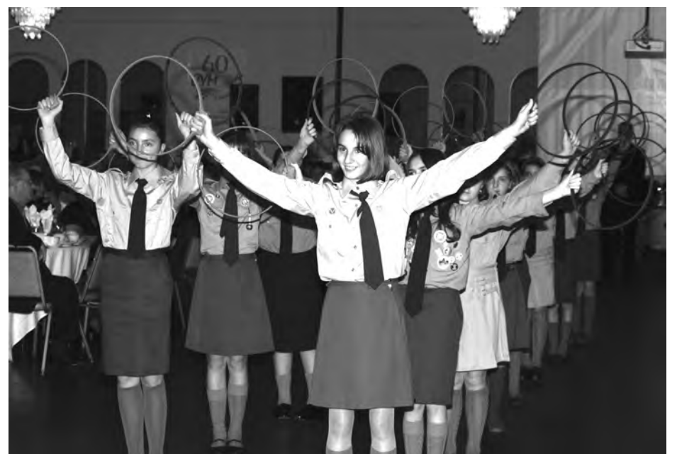
Chicago youths perform at the banquet.