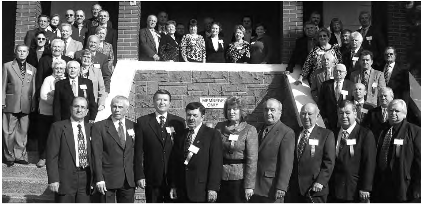
Participants of 28th National Convention of the Organization for the Defense of Lemko Western Ukraine.

During the discussion of reports, delegates made suggestions about financial and organizational issues, including: the dis-