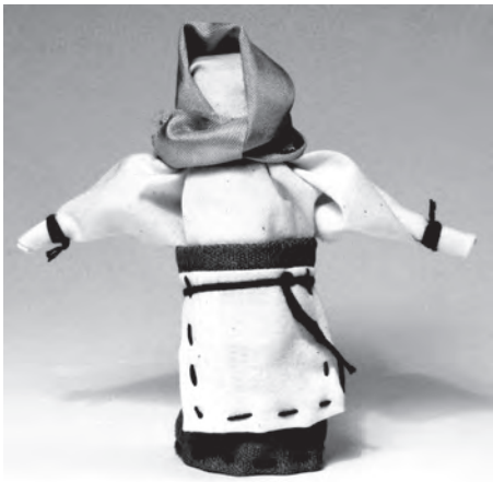
An example of a “motanka,” a Ukrainian doll constructed from scraps of cloth.

The first workshop took place at St. Anthony’s Ukrainian Orthodox Church and was part of “Super Saturday,” a festival for the children of the parish. The second was in the newly re-located Bohdan Medwisky Folklore Archives at the University of Alberta. The archive has moved to more spacious quarters in the Arts Building, Room 250, which allows for the hosting of public events. The first such event was the screening of the Ukrainian horror film Shtol’nia in time for Halloween. The motanky workshop was