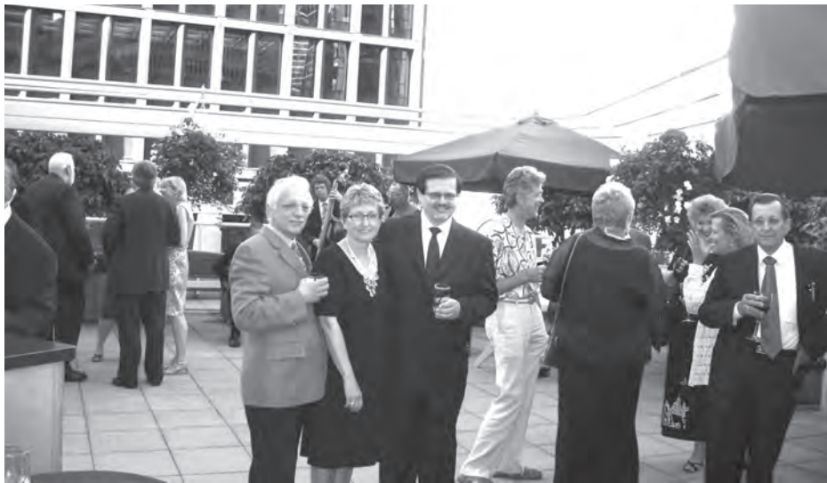
UMANA members enjoy the social hour at the Vancouver Pinnacle Hotel.

On Saturday evening, the attendees enjoyed a memorable twilight harbor cruise with dinner while viewing the dramatic Vancouver skyline. This cruise served as a fitting conclusion to the conference, with discussions revolving around the new information learned at the conference. Members were heard actively planning events for 2011, exploring possible locations for the next UMANA scientific conference and Assembly of Delegates, and looking forward to continuing a long-standing custom of informational and social exchange.