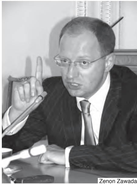
Arseniy Yatsenyuk in a photo from November 2008.