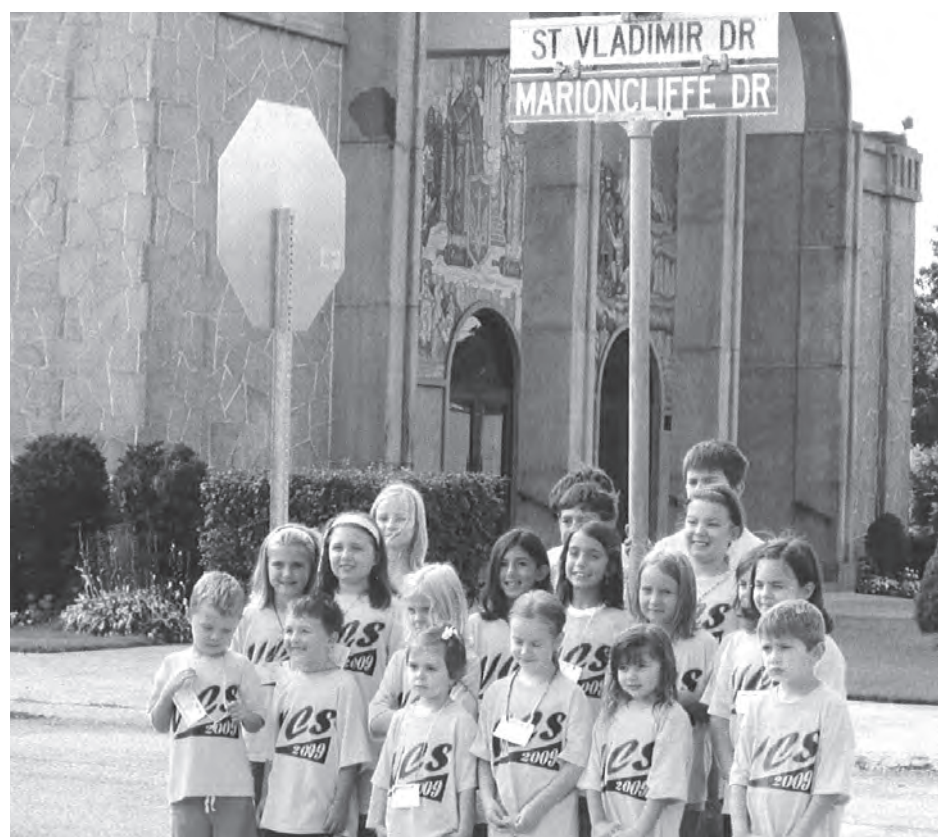
Children from the Vacation Church School of St. Vladimir Ukrainian Orthodox Cathedral in Parma, Ohio, stand below the sign for the newly names St. Vladimir Drive.

A demonstration by third- and fourth-generation young people reaffirmed the preservation of Ukrainian arts, history and language sponsored by the Ukrainian Cultural Institute and the North Dakota Ukrainian Dance Association.