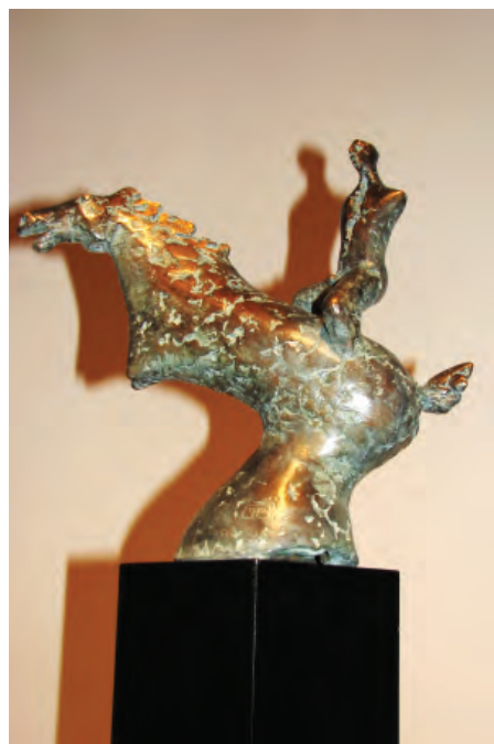
“Call of the Steppe” by Vasily Fedorouk.