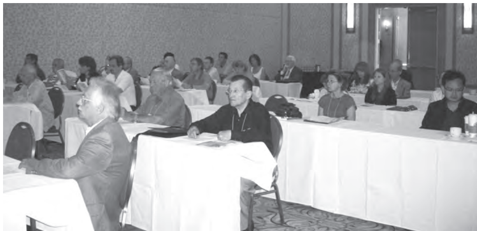
Conference attendees absorb lecture material.