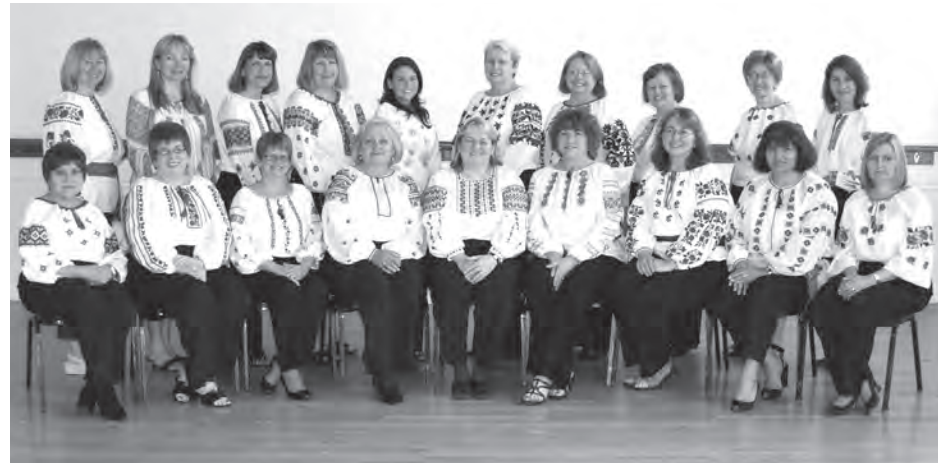
Members of the Chicago-based Alla Horská branch of the Women's Association for the Defense of Four Freedoms for Ukraine.

The Alla Horská branch has worked tirelessly during its 25 years of existence. And, it continues to grow in its responsibilities and efforts.