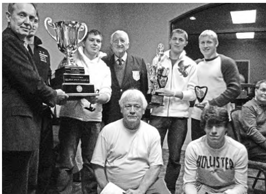
The youth division winner, Lys Sports Academy, receives trophies from meet officials and sponsors.