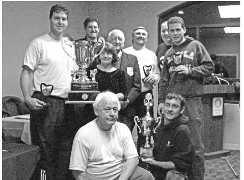
The men's open division champions, Lys Sports Academy of Whippany, N.J., receive the traveling trophy.

At the awards ceremony and dinner held afterwards at the Ukrainian American Cultural Center of New Jersey in nearby Whippany, team and individual trophies were presented to the winners. USCAK officials reminded all the athletes to prepare for the 2008 Ukrainian Diaspora Olympiad and Youth Rally to be held over the Fourth of July weekend at the Ukrainian American Sports Center Tryzub in Horsham, Pa. (For information log on to http://tryzub.org/olympiad08.htm .)