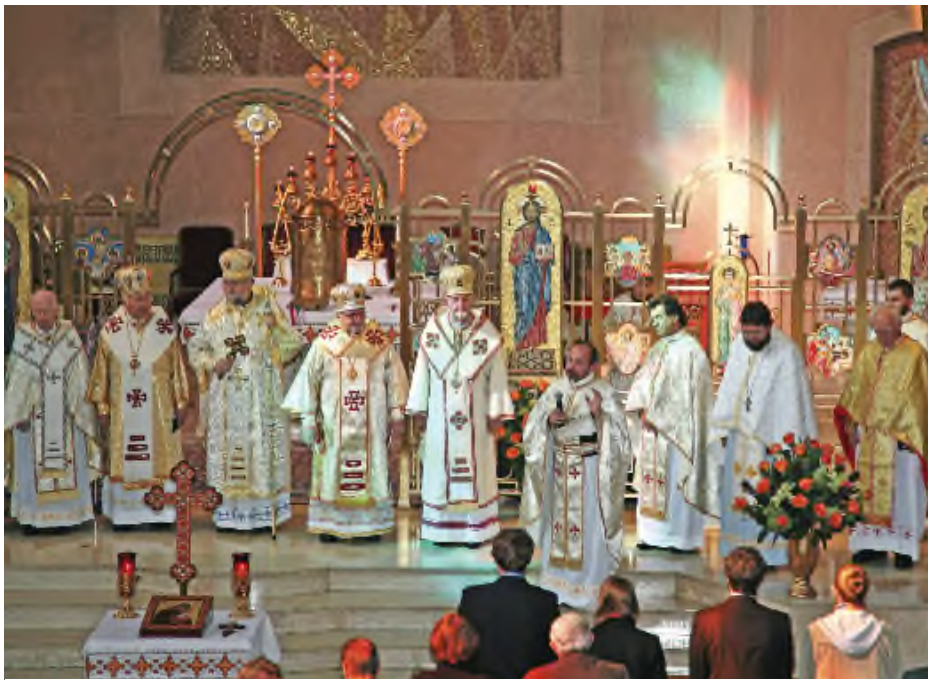
Priests, bishops and the metropolitan join in celebrating the diving liturgy marking the centennial of St. John's Parish.