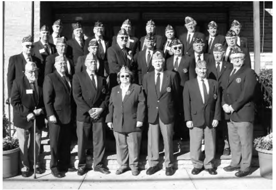
Delegates to the UAV's 60th national convention.