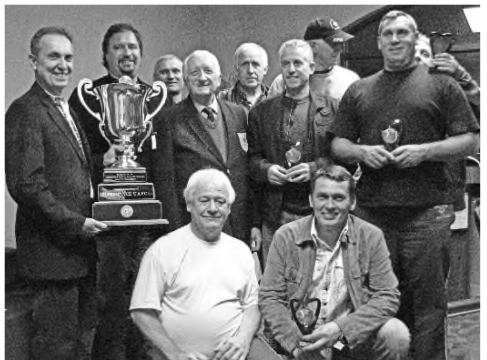
Chicago Slava, winner in the senior division, and with their team trophy.