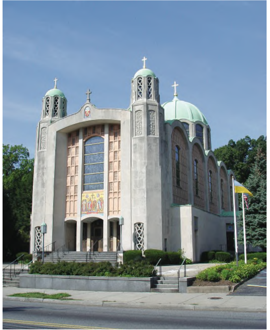
St. John the Baptist Ukrainian Catholic Church in Newark, N.J.