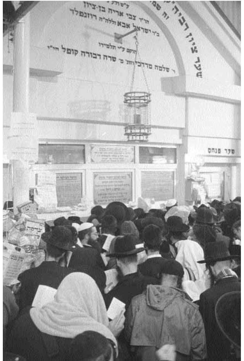
A view of Hasidic Jews praying in Uman, the burial place of Rebbe Nachmann.