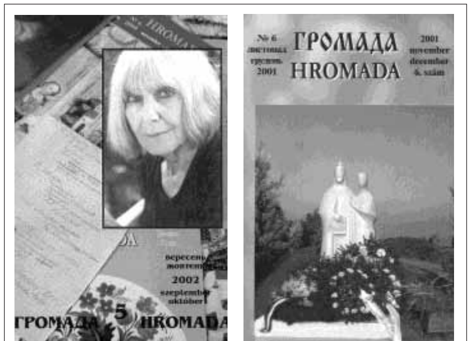
Covers of two issues of the Hromada magazine.

Yet another issue, that of January-February 2001, which is dedicated to the 10th anniversary of the UCSH, gives coverage to such events as the 10th European Congress of Ukrainians, which