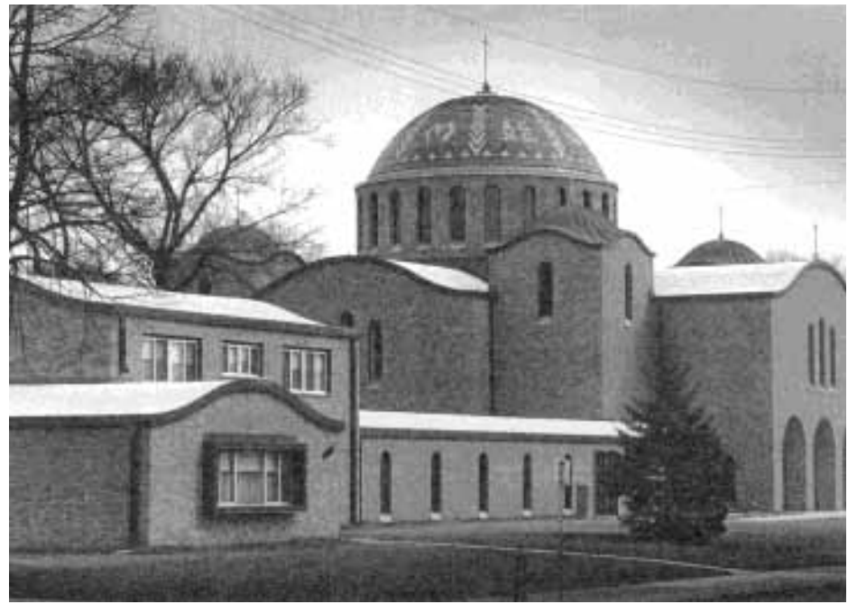
St. Constantine's Ukrainian Catholic Church in Minneapolis.

Soon these two regional branches of the Ukrainian nation, whose land for many years remained under different foreign occupations, developed some ideological differences that eventually led to estrangement. Those from Halychyna not only retained their Byzantine Rite, but possessed a Ukrainian spirit that extended beyond the borders of regionalism.