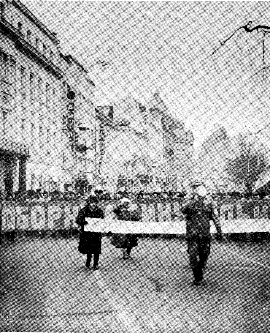
Marchers in Lviv rally on March 10 against the union referendum. The banner expresses support for "one, sovereign and free Ukraine."