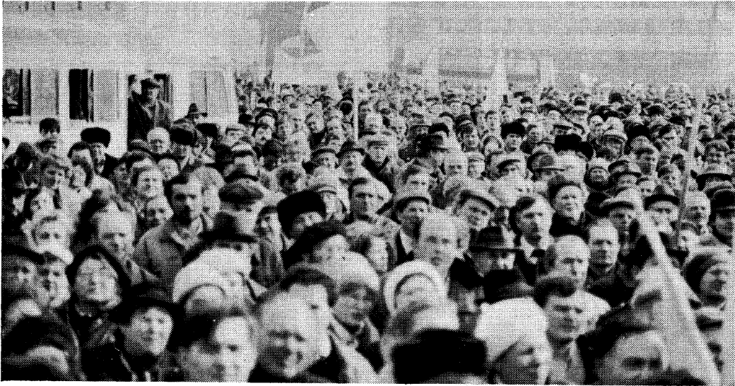
Crowd gathered at anti-referendum rally in Kiev on March 16.