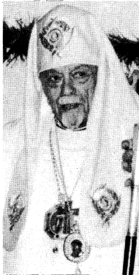
Patriarch Mstyslav I