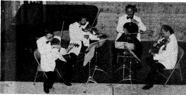
The Leontovych Quartet from Kiev performs at the Grazhda in Lexington, N.Y.

For additional information about the 1991 season of the Music and Art Center of Greene County please call (518) 989-6479.