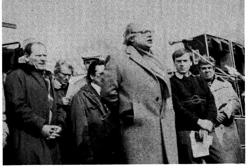
and Ivan Drach.