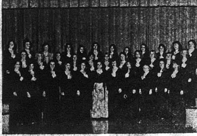
Manor Junior College's girl choir.