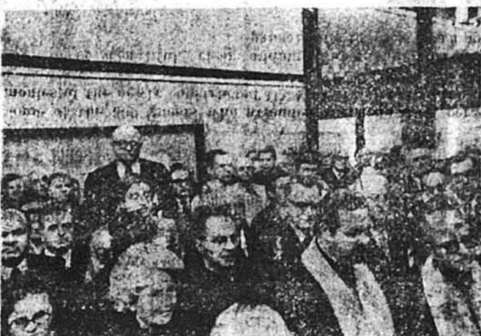
Some of the 300 guests who attended the dedication ceremonies of the newly constructed UNA "Ukrainian Building".