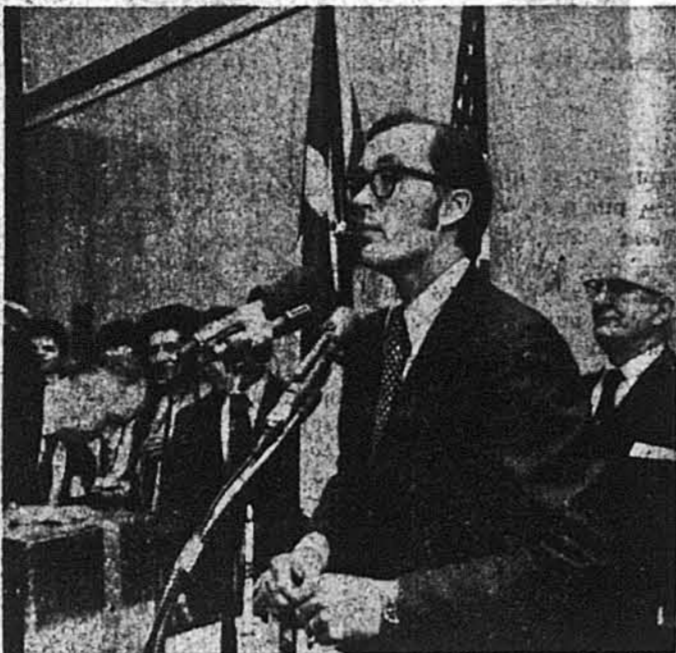
Jersey City Mayor Paul Jordan addressing the gathering in the lobby of the "Ukrainian Building".