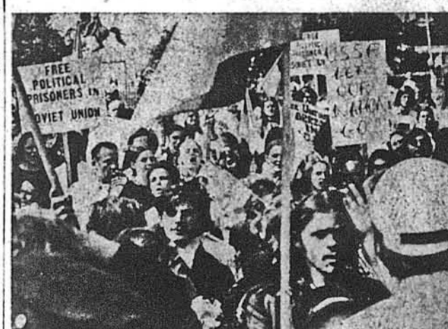
Signs tell the purpose of the manifestation at the White House.