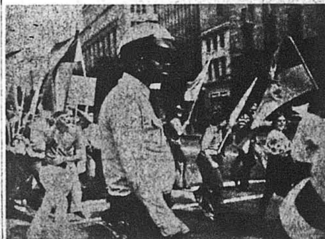
Marchers, escorted by the police, make their way to the White House.