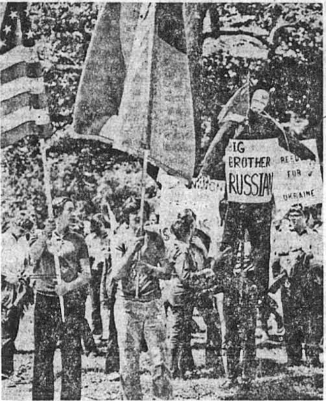
Young people ready banners and the effigy, later burned, for the demonstration at the Soviet Embassy.