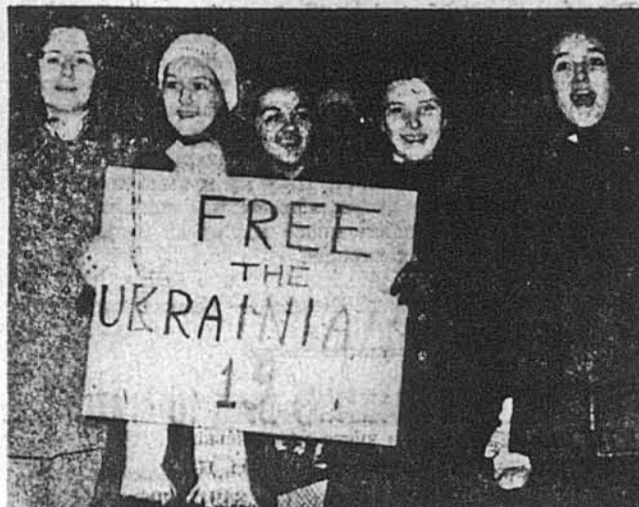
SLOGAN OF THE DAY: A group of Passaic girls from Passaic, N.J., display the sign that told the purpose of the demonstration.