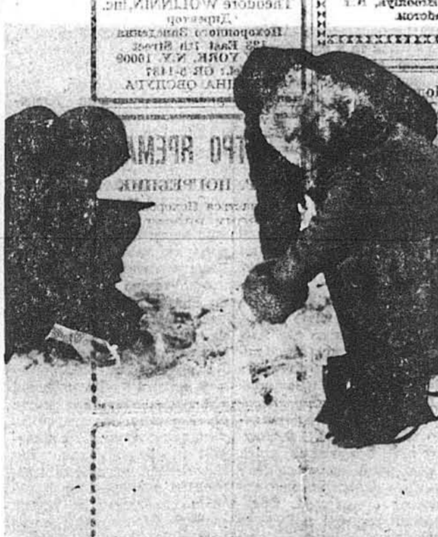
A group of fourth graders from St. George's Ukrainian Catholic School made a candle lit cross in the snow. Photo above shows two of them being helped by their teacher (left).

recapped the action to the applauding crowd through the loudspeakers. With the crowd dispersing and the buses taking back the out-of-town demonstrators, some of the TUSM members and other students drove their truck to the Felt Forum where the Russian poet Yevgeni Yevtushenko was readying for his second poetry recital.