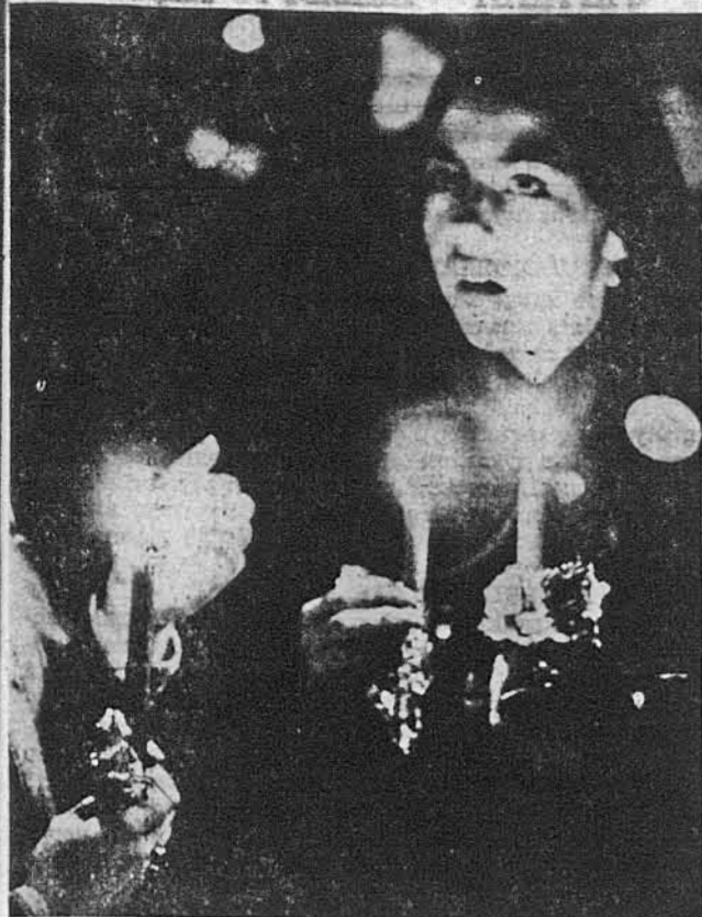
The somber face of a girl, illumined by candle light, reflects the mood of protest.