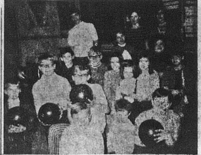
A group of UNA's youngest bowlers in the Penn-Ohio tourney.

Aliouppa's No. 2 team took the runner-up trophy in the men's division with a total of 2,647, only two pins behind the winners.