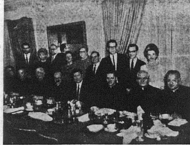
Officers of the League of Ukrainian Catholics, as well as some of the League's spiritual advisors, shown above, were honored at a special banquet in Frackville, Pa.

FRACKVILLE, Pa.—“The members of the League of Ukrainian Catholics want you to know they are extremely appreciative that you have given of yourself unselfishly for four years as national officer of the League, and that through your efforts, concern and dedication the League was able to survive its hardest years. You cannot be praised enough for what you have done for LUC, you cannot be honored more than to know you have served not only our organization, but the Ukrainian Catholic Church and God.”