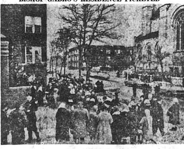
The scene at St. Nicholas Cathedral in Chicago on January 19.

One priest was injured and two others jostled by the group at the cathedral. Four in the group were arrested. They consisted of members of a group called the Committee for the Preservation of Ukrainian Catholic Traditions, who object to the church's celebration of holidays according to the Gregorian rather than the Julian calendar.