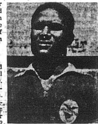
Eusebio de Silva Ferreira Portugal's Greatest

The tournament will mark the first appearance in this country of two of the best players in the world, Pele from Brazil and Eusebio from Portugal.