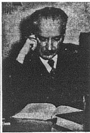
Проф. Дмитро Дорошенко Перший Президент УВАН

Таким чином утворилися три центри УВАН: в Канаді, в Сполучених Штатах Америки і в Європі. Для того,