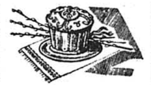
The articles will be on view in the two main cases during the entire month of April.

"Soyuz Ukrainok," Branch 36, from the southside of Chicago, is holding an exhibit of Ukrainian art at the Chicago Lawn Public Library, 6234 South Kedzie Avenue.