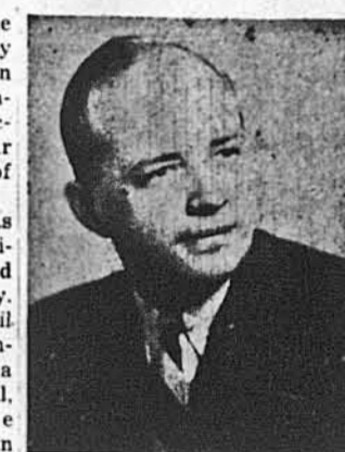
Dr. Lev E. Dobriansky

Guidelines for Cold War Victory calls for a "viable U.S. foreign policy" aimed concurrently at: 1) halting further Communist expansion; 2) promoting the national independence