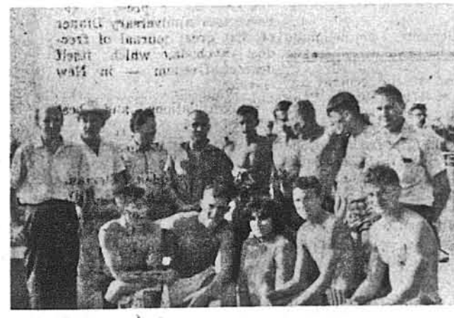
Swimmers and officials after the conclusion of swimming events.