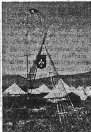
Entrance gate to the Ukrainian Scout Camp at Marathon, Greece