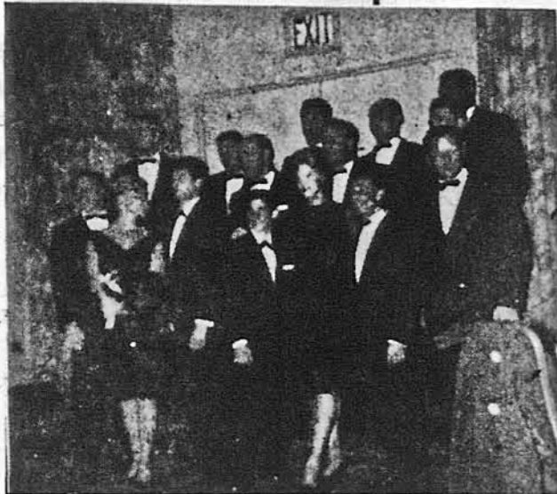
In the picture above are some of the participants at the "Dinner of Champions" at the Hotel Astor.