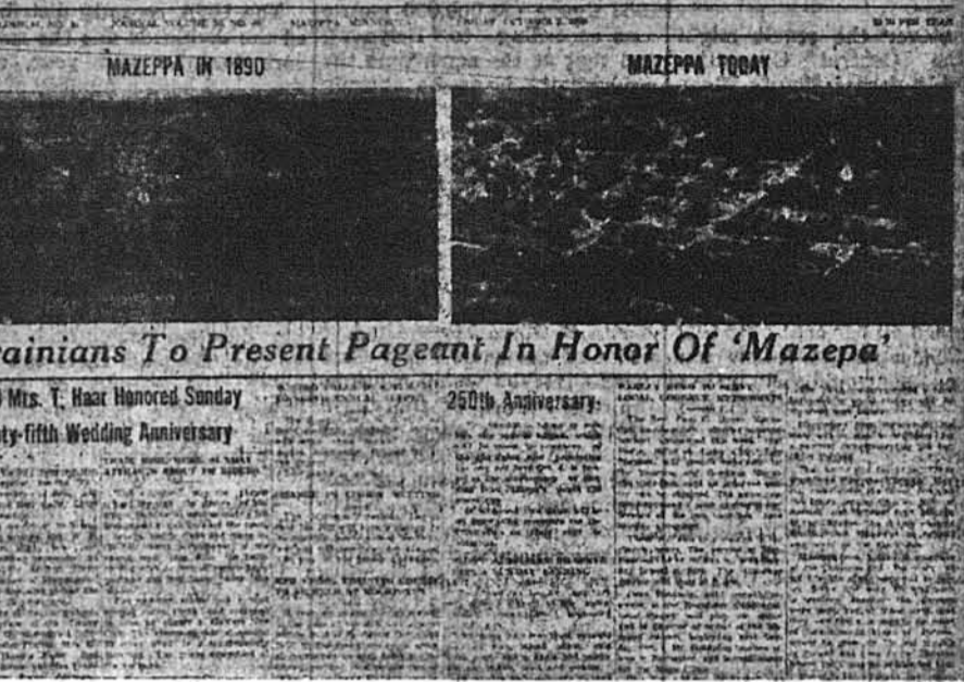
The front page of THE MAZEPPA JOURNAL in Mazeppa, Minn. The two photographs present the town as it looked in 1890 and today.