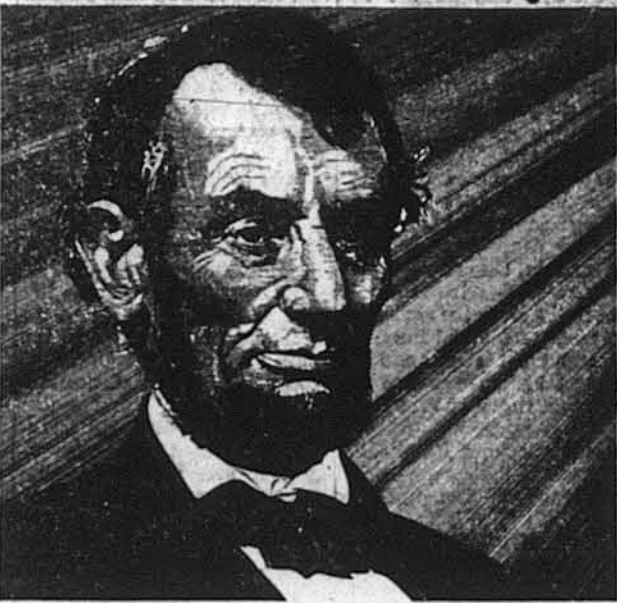
The Great Emancipator who declared that the world cannot exist half-slave and half-free.