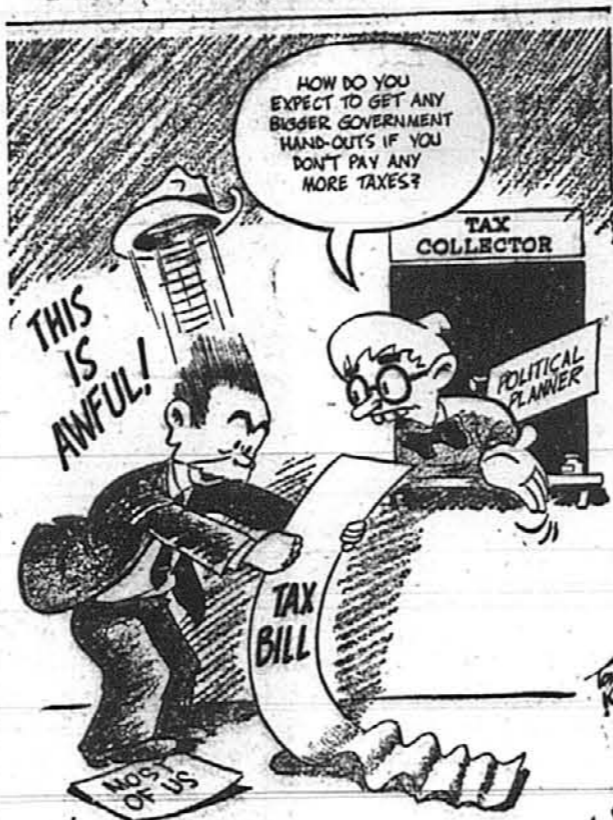
At Last The Truth